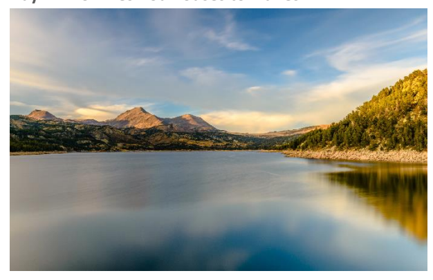
Day 4: From Les Bouillouses to Planès

Starting from Les Bouillouses, a walker's paradise and a small Canada of the Pyrenees, the GR10 goes through plateaus, mountain lakes and forests. After reaching Bolquère, close to the famous resort of Font Romeu, you will cross the vast high plateau of Cerdagne, a landscape found nowhere else in the Pyrenees. Then you will reach Planès, a magnificent village with its Romanesque church, unique in Europe with its trefoil plan.