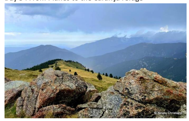
Day 5: From Planès to the Carança refuge

The profile of the walk is reminiscent of a rollercoaster, with a descent often corresponding to a pass or a high plateau to be crossed. Today, the Pla de Cédeilles (1911m), and the Mitja pass (2367m), a remarkable lookout point towards the nearby Capcir and the emblematic Pic du Carlit, are on the programme, with landscapes that become Mediterranean.