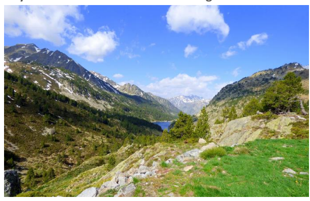
Day 2 : From Mérens to Bésines refuge

From Mérens, the GR10 leaves the Haute-Ariège to approach the Capcir region. This is a classic Pyrenean walk of deep valleys and passes. A long ascent along the valley and the torrent of the Nabre will lead you to the Porteille des Bésines, at 2333m. Then you will descend to the Etang des Bésines and its guarded refuge. From the terrace of the refuge, the view towards the Etang des Besines and the nearby Pic Pédros is superb.