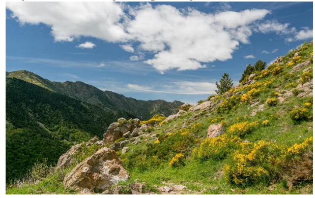
Day 6: From Carança refuge to Py

Today, you will walk from the refuge of the Caranca to the hamlet of Py. The GR10 crosses the reserve natural of Mantet and then the reserve of Py. There is a passage across the Col del Pal (2294m), with a wonderful panorama. If the weather is good, a short round trip (+1h30) to the easy Serre Gallinière peak will broaden your horizon even more. And after the Alemany valley and reserve, you will join the village of Py, where you spend the night.