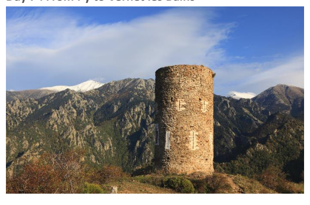
Day 7: From Py to Vernet les Bains

From the village of Py, the Mediterranean atmosphere becomes more and more pronounced, especially with regard to the vegetation. Thus, a balcony route over the Rotja valley leads to the Goa tower located on a small natural platform offering a beautiful panorama of the Canigou peak and the Haut Conflent. Then a ridge path followed by a forest descent leads to Vernet-les Bains.